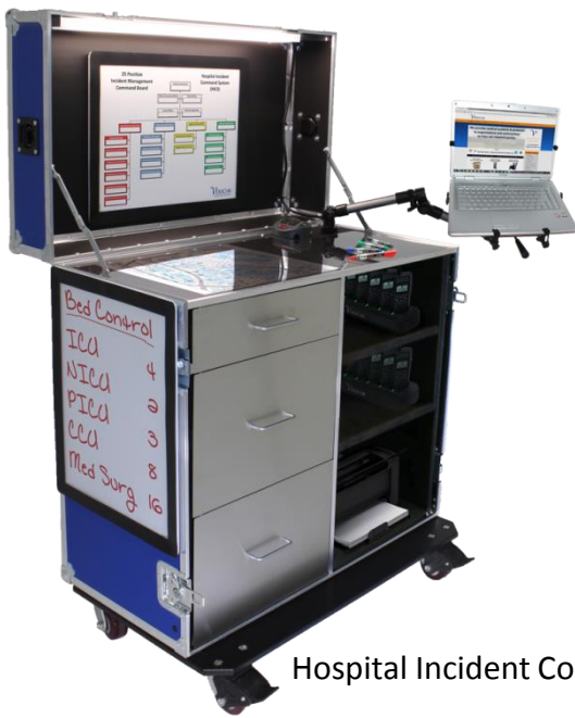
Hospital Incident Command Center