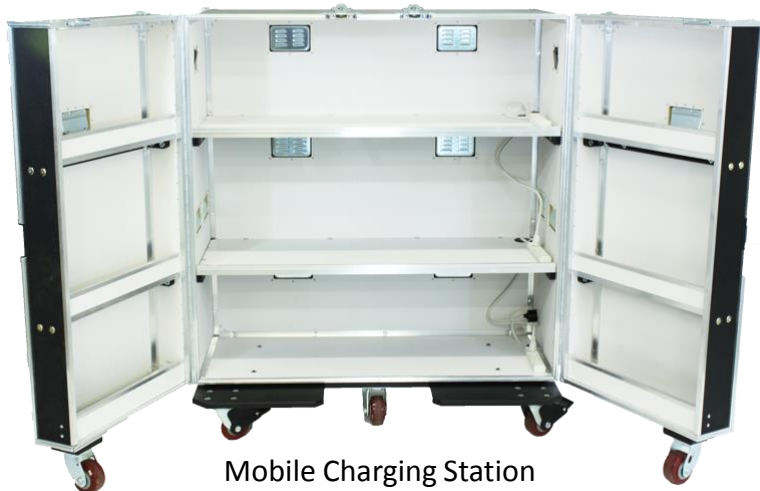
Mobile Charging Station

Store, organize and mobilize current assets with these Response-Friendly™ cases and organizers.