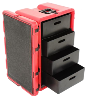
4-Drawer Mobile Medical Case