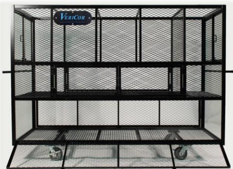
Litter Equipment Organizer