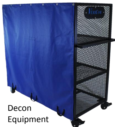
Decon Equipment Organizer