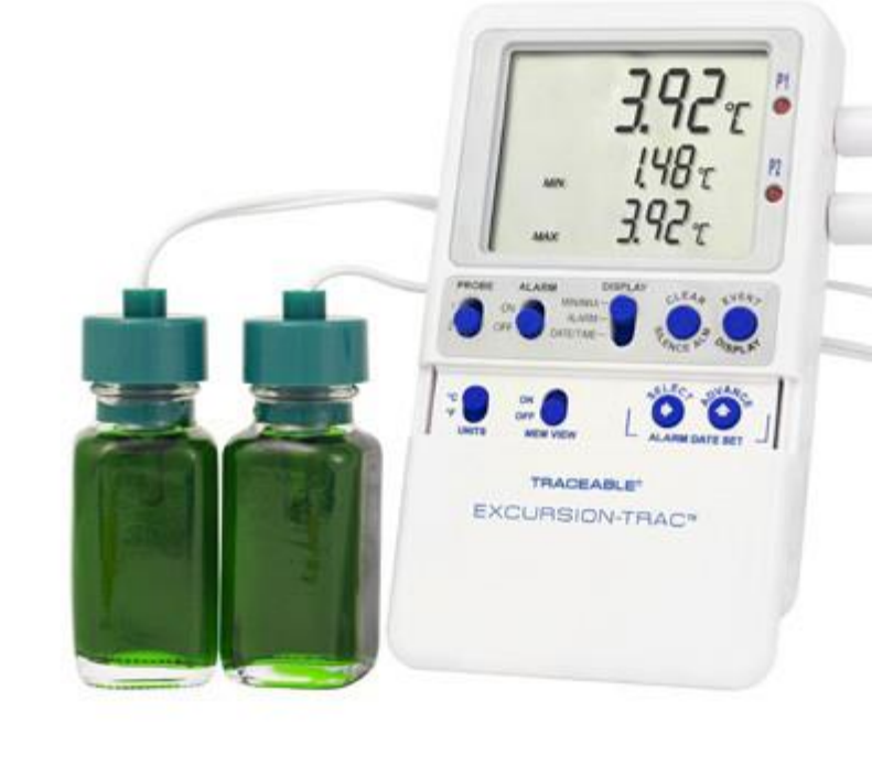
10' Probe Cables/2 Probes

Dimensions & Weight 23/4" x 41/4" x 3/4" @ 5oz