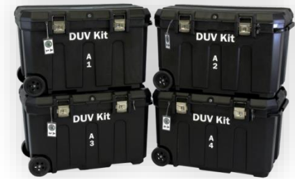
Wheeled Medical Cases