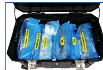
2 Cases - contain items inserted into overhead cabinets (view from above)

Designed as a supplementary set for the VA Dual Use Vehicles. *SmartBook™ operator's manual included!