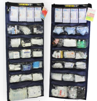
Upright Medical Organizers (UMOs)