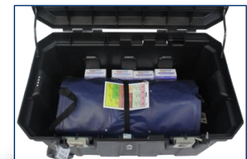
2 Cases - contain UMOs and supplies (view from above)