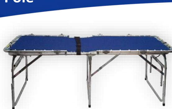
Folded (Dual View)

The Active Patient Care (APC) Bed is designed with patient surge treatment care needs in mind. This taller, procedure height bed allows healthcare professionals to perform necessary functions at a working height. In the event of an overflow, the APC doubles effectively as a temporary cot.