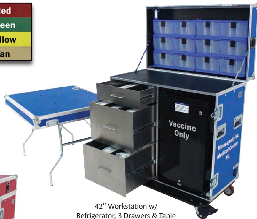
42" Workstation w/ Refrigerator, 3 Drawers & Table