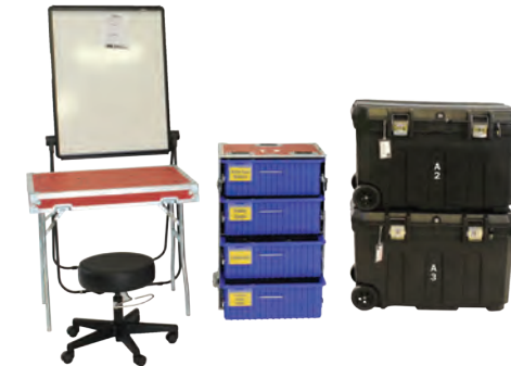
Administrative Support - ER