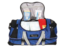
Vaccinator 500 Go-Bag

Rapidly establish an immunization site with a Response-Friendly™ Vaccination System to protect the community when a vaccination campaign (large or small) is needed.