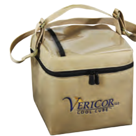
Cool Cube™ 50 65+ hours