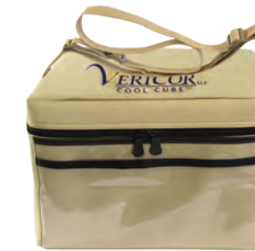
Cool Cube™ 100 76+ hours