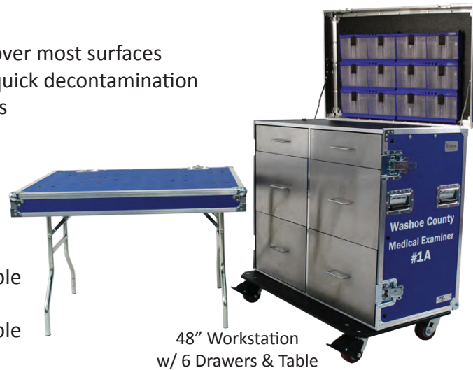
48" Workstation w/ 6 Drawers & Table