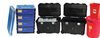
Vaccinator 2500 Go-System