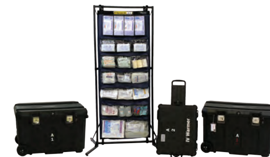
Intravenous Therapy Advanced - ER