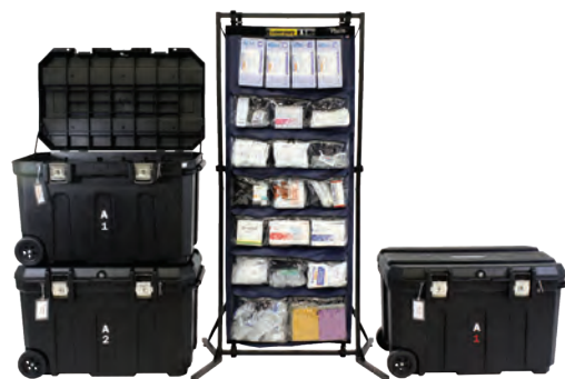
Laboratory - ACS