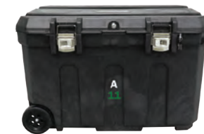
Mobile Medical Case