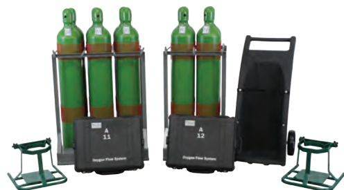
Oxygen Supply - ACS