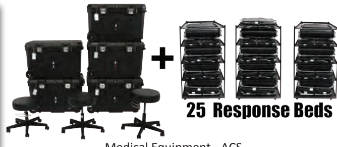
Medical Equipment - ACS