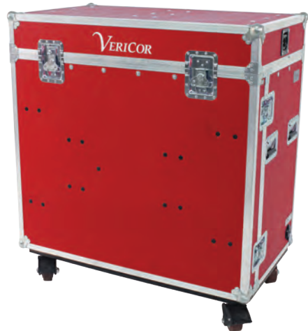
42" Workstation (closed)