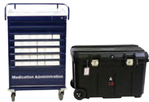
Medication Administration - ACS