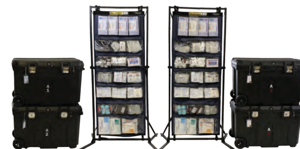
Wound Care - ER