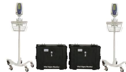
Vital Signs Monitoring - ER