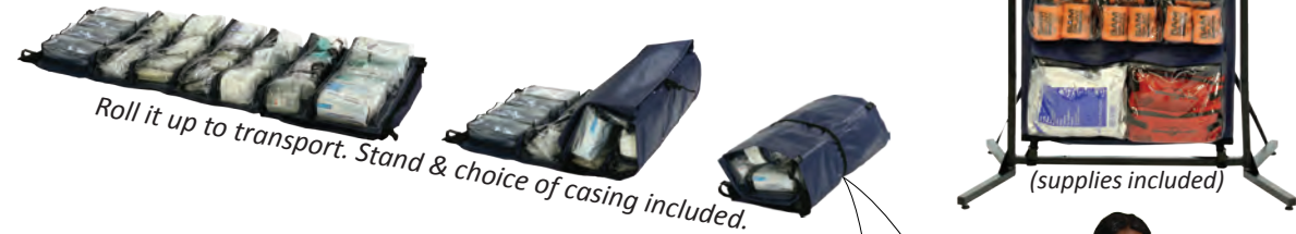
Roll it up to transport. Stand & choice of casing included.