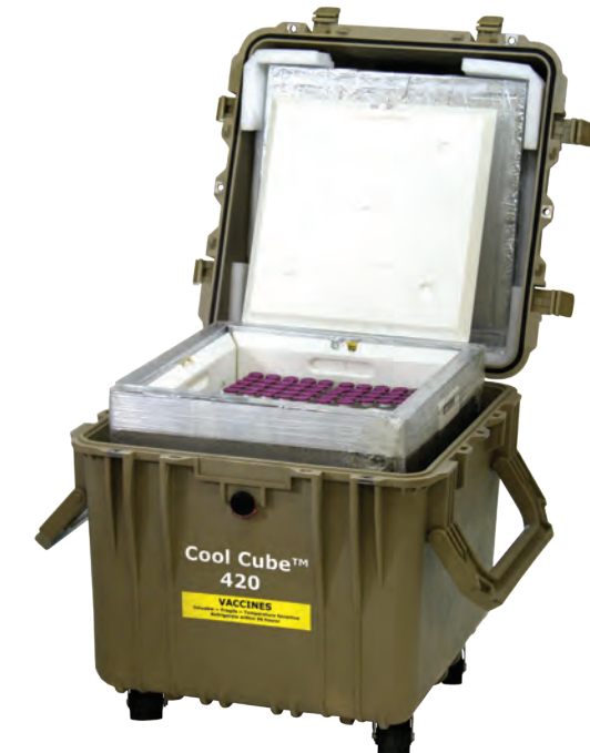
Cool Cube™ 420 106+ hours