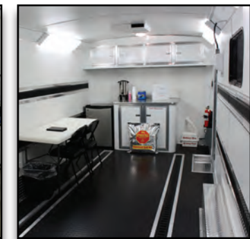
Emergency Operations Center (EOC) Package